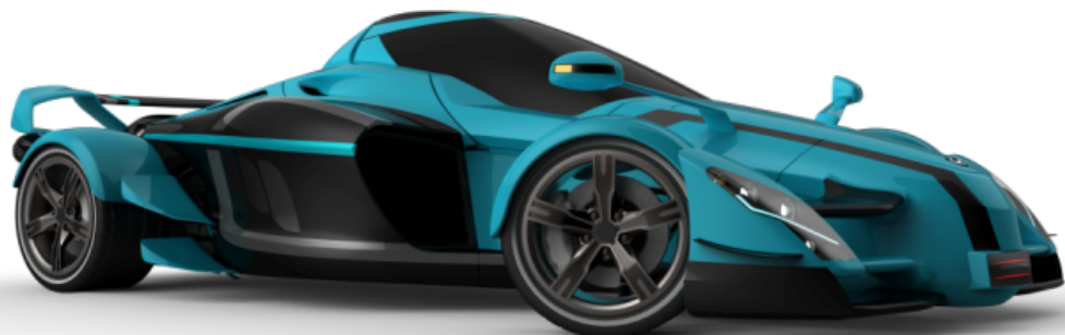
Tramontana XTR Blue Edition