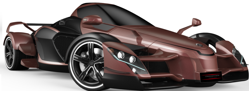
Tramontana XTR Chocolate Edition