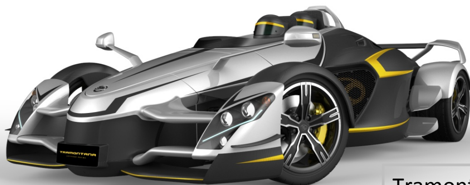
Tramontana XTR Racing Spirit